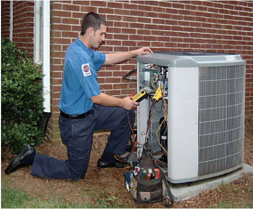
Quality Maintenance from Educated Technicians

Here are 8 reasons to invest in a maintenance agreement.